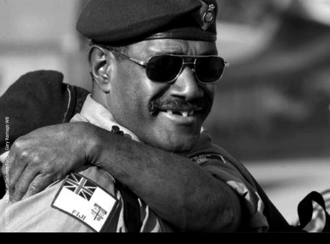
Part I. Introduction