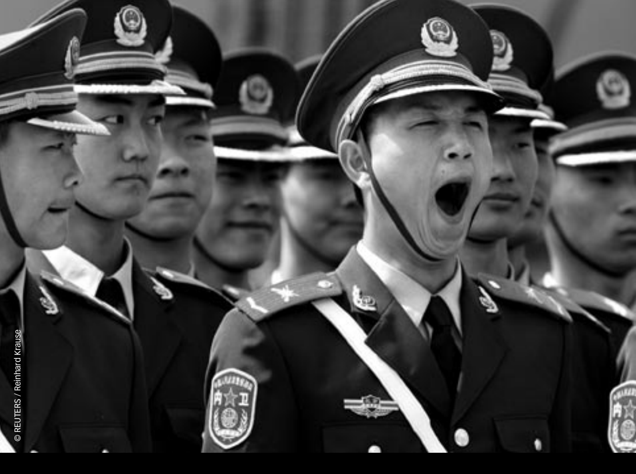
Part II. Achieving the Objectives of Law and Order